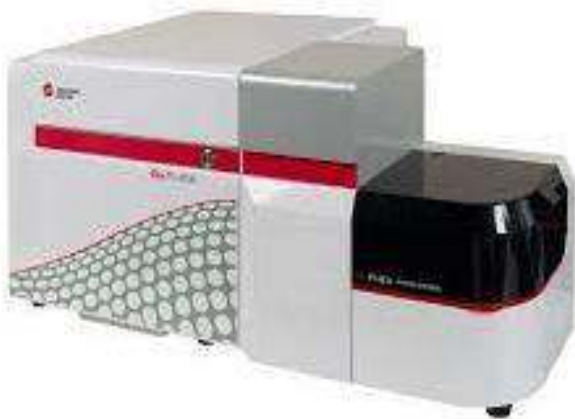
BECKMAN COULTER DX FLEX