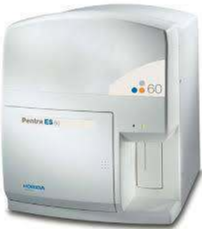
HORIBA PENTRA ES60