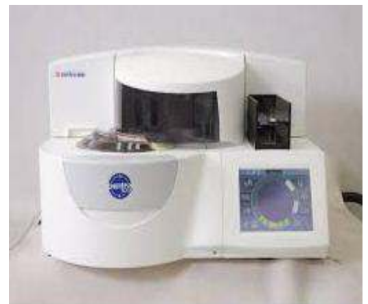
HORIBA PENTRA 400