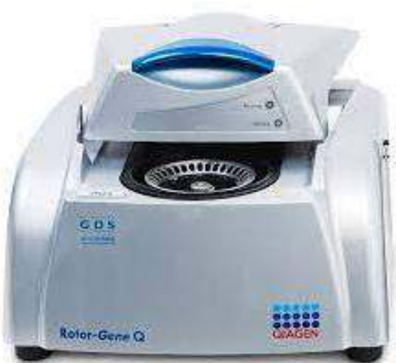
ROTOR GENE Q