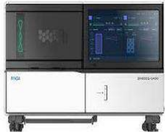
MGI DNB Seq